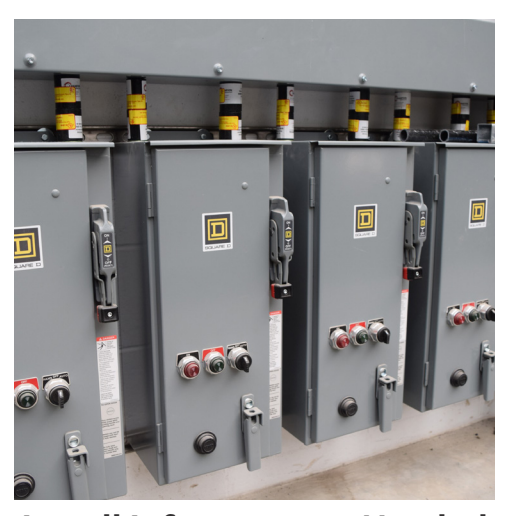
Install Infrastructure Needed for these Upgrades and More