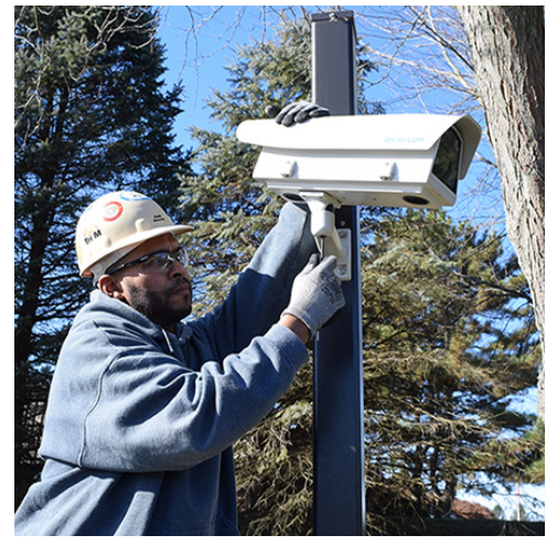
Update Security Systems Including Thermal Imaging