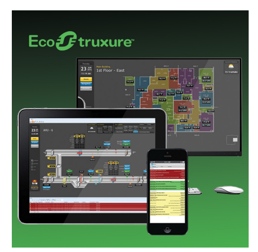
Upgrade Outdated Building Automation Controls