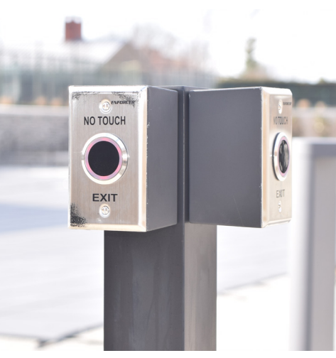
Upgrade Access Control to Include "No-Touch"